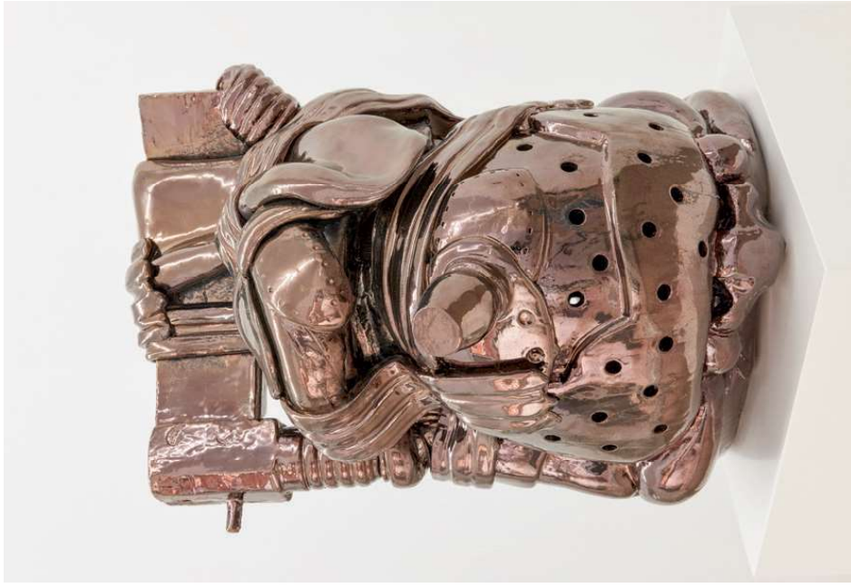
Wesley Spragg

thus to a new sculpture. That makes it also fascinating. I never fully know what the final result will look like. Coincidences or failures are just an asset. That is what happens in the clay, the material sets its own conditions,' we hear the artist say.