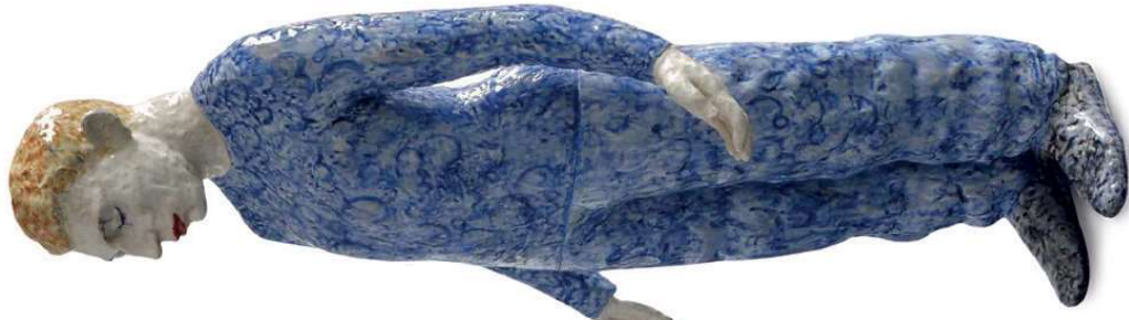
Ervinck Studio Nick Ervinck

The heads are shaped larger than life directly into the clay and then painted with glaze. The way the artist does this, gives the facial features of the heads extra expression. Without any frills, emotions are made recognisable. The sculptures have human, but sometimes also inhuman features: big ears, long noses or a distorted mouth. The robustness of