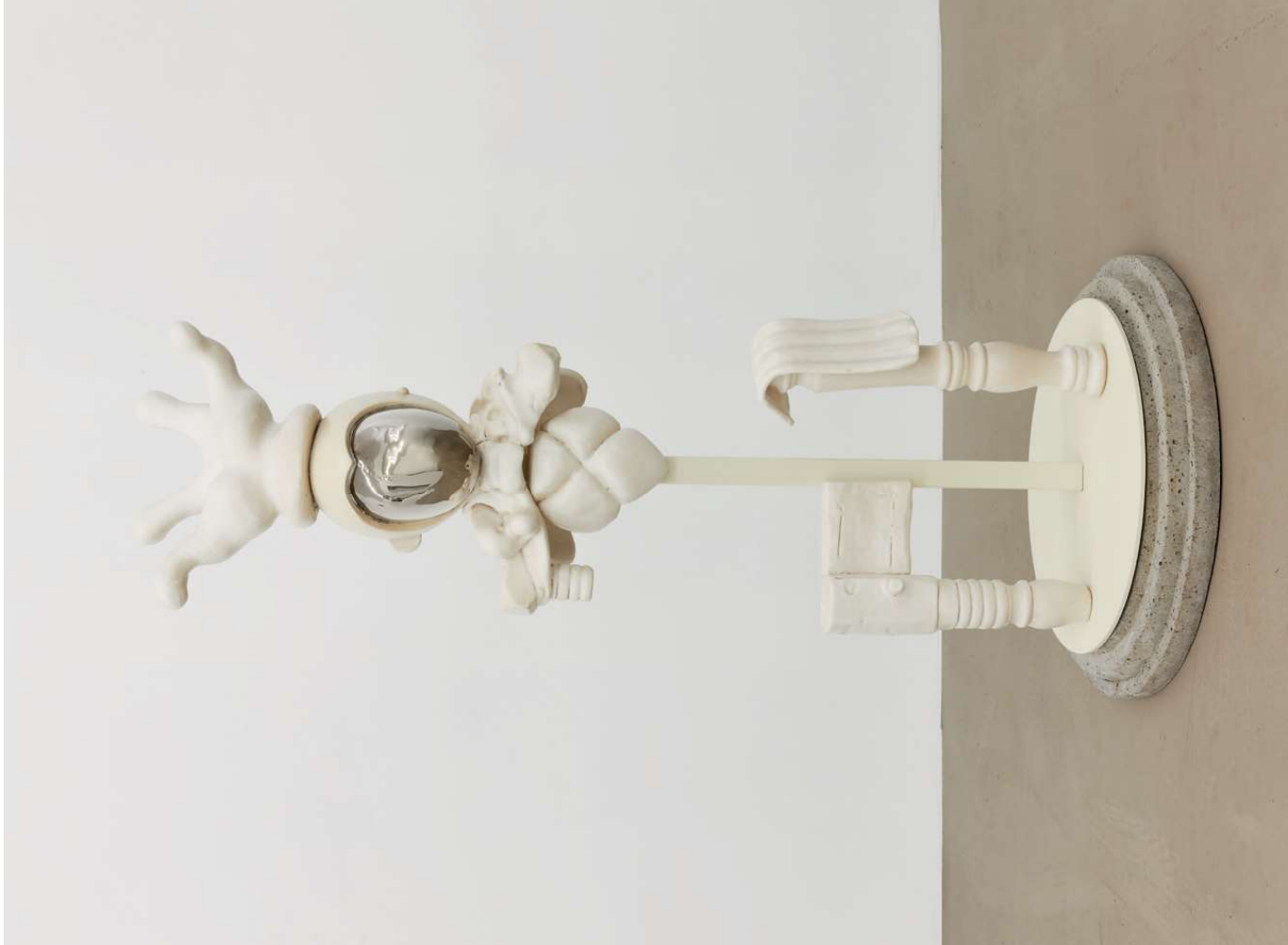
Chris Orland / Photo: The Document Art

or weighty the reference. Popular child heroes like Goofy carry just as much weight as Mexican masks and sculptures by classical or modern masters like Bernini. I have a lot of documentation in my studio of everything that interests me: from museums to ordinary